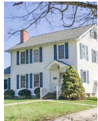
Wiseman Cottage 205 Wiseman Ave.

4 bed | 2.5 bath sleeps up to 10, pet friendly