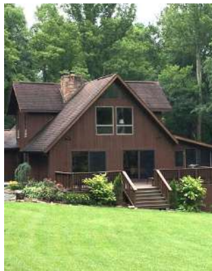
Sugar Creek Chalet 208 High St.

4 bed | 4 bath sleeps up to 15, pet friendly