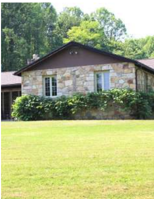
Ramsey Mountain Lodge 212 High St.

Cascade Properties' partner company, Mountain Vacation Properties, has four vacation rental properties in Fayetteville. All four houses have been fully remodeled In the last five years. These houses can be rented through http://VRBO.COM for the wedding party or out of town guests. Links to view these houses are below.