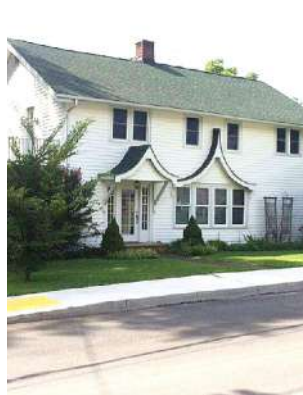
Historic McGrath House 206 W. Maple Ave.